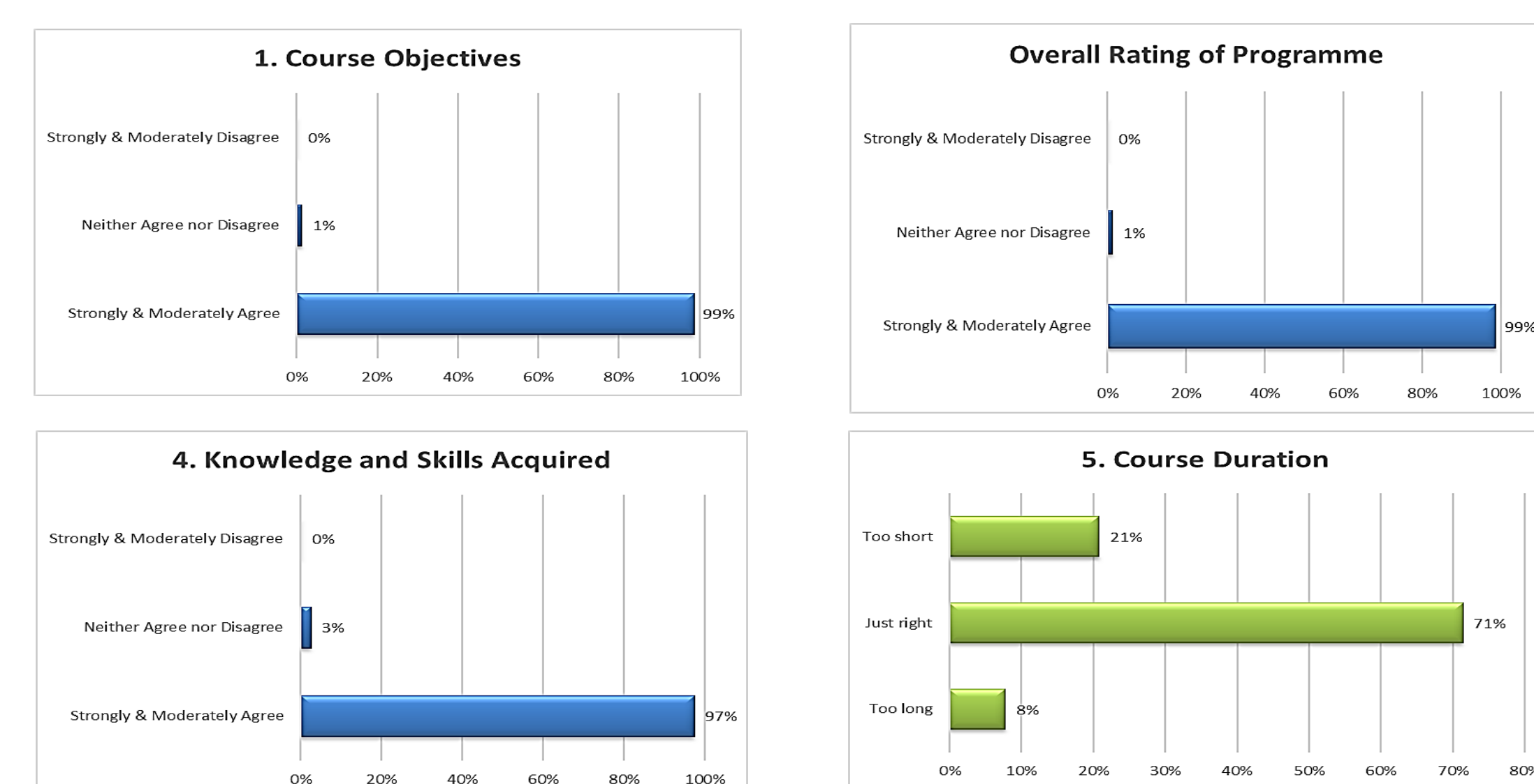
(Figure 1: Post course evaluation of Care Ambassador Training)

A total of 132 cabin crew were trained to take on the Care Ambassador role in SGH Inpatient wards. They worked alongside the care team to provide basic nursing care to patients. The 5-day training programme had provided confidence to the Care Ambassadors by empowering them with the required competencies to carry out the patient care activities effectively as well as improving the patient care outcomes. The feedback received from the post course evaluation was very positive (Figure 1). Care Ambassadors shared that the course was very well paced and organised. The onboarding of the Care Ambassadors had also helped to augment the nursing manpower on the ground during the peak of COVID pandemic. It also provides an opportunity for the cabin crews to gain insight into the healthcare industry.