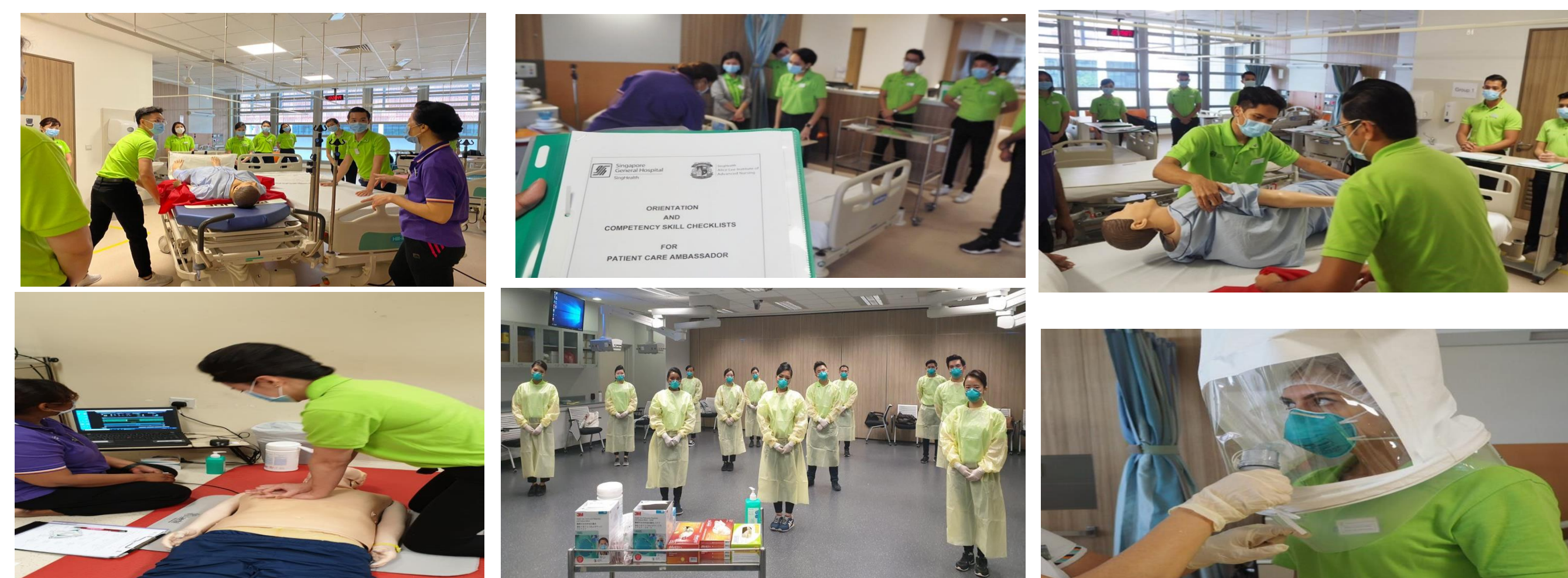
(Photo 1-6: Care Ambassadors undergoing various simulation training on safety measures and attending BCLS and AED Training.)

During Classroom Practical Assessment, Care Ambassadors were assessed on the necessary skills using a competency checklist during the training (Photo 1-6).